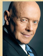
Stephen R. Covey

is understanding life as fundamentally a relational experience with God and with His creation.